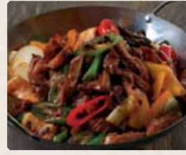
410 - $23.80 干鍋大腸 Chilli Pork Intestine in Hot Wok