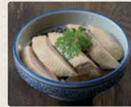
201 - $15.80 南京鹽水鴨 Nanjing Style Salty Duck (Served Cold)