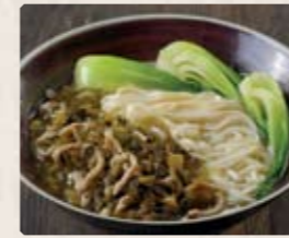
916 - $13.80 雪菜肉絲湯麵 Preserved Vegetable with Shredded Pork Noodle Soup