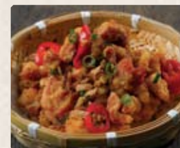
308 - $22.80 香炸八塊 Salt & Pepper Chicken Fillet