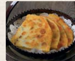
109 - $9.80 外婆蔥油餅 Grilled Spring Onion Pancakes (4 pcs)