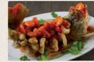
508 - $32.80 松鼠魚 Barramundi in Sweet & Sour Sauce