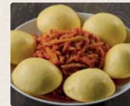
303 - $26.80 魚香肉絲+金窩 Szechuan Style Shredded Pork + Golden Buns