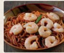
914 - $15.80 鮮蝦蔥油麵 Stir Fried Noodles with Crystal Prawns & Spring Onion