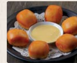
111 - $9.50 金色小刀切 Deep Fried Chinese Milk Dough (6 pcs)