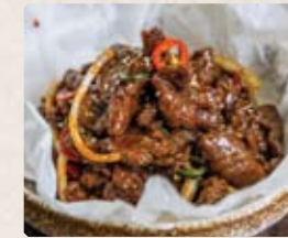
328 - $23.80 紙包生煎小牛肉 Paper Wrapped Tender Beef Cooked With Sliced Onions & Chilli Sauce (Option Without Chilli)