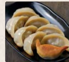
102 - $14.80 上海鮮肉鍋貼 Pan Fried Pork Dumplings (8 pcs)