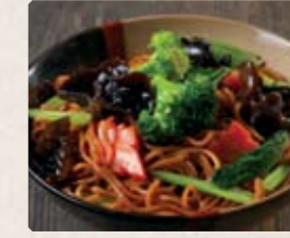
910 - $15.80 時菜炒麵 Stir Fried Noodles with Seasonal Vegetables