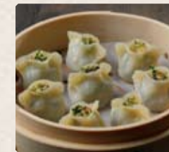
104 - $12.80 花素蒸餃 Vegetarian Steamed Dumplings (8 pcs Contain Egg)