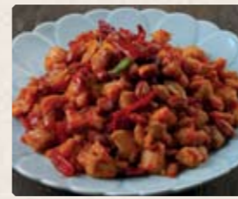
402 - $21.80 宮保雞丁 Kung Pao Chicken with Chilli Sauce & Peanuts