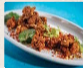
327 - $22.80 香辣密椒雞 Crispy Fried Popcorn Chicken With Special Spices (Contain Peanuts)