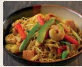
911 - $15.80 星洲炒米粉 Singaporean Noodles