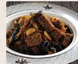
210 - $11.80 四喜烤麸(冷食) Sweet Kao Fu with Wood Ear & Enoki Mushrooms (Served Cold)