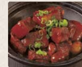
323 - $27.80 鴿蛋紅燒肉 Braised Pork Belly with Quail Eggs