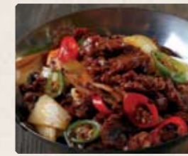
408 - $27.80 干鍋羊肉 Chilli Lamb in Hot Wok