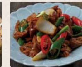
307 - $22.80 尖椒肥腸 Stir Fried Pork Intestine with Chilli Peppers