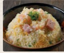
901 - $14.80 揚州炒飯 Yangzhou Fried Rice