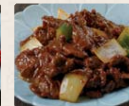
316 - $22.80 蠔油牛肉 Beef in Oyster Sauce