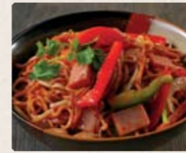
915 - $15.80 馬來炒麵 Mee Goreng (Malaysian Combination Stir Fried Noodles)