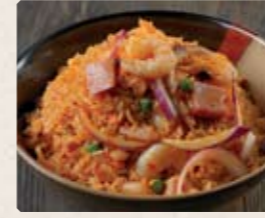
904 - $15.80 馬來炒飯 Nasi Goreng (Malaysian Combination Fried Rice)