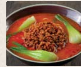
917 - $14.80 四川擔擔麵 Spicy "Dan Dan" Noodle Soup