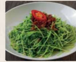
604 - $20.80 XO醬生煸豆苗 Stir Fried Snow Pea Sprout in (XO Sauce Contain Shrimp)