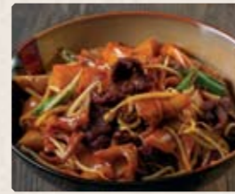
913 - $15.80 干炒牛河 Stir Fried Rice Noodles with Beef & Bean Sprout