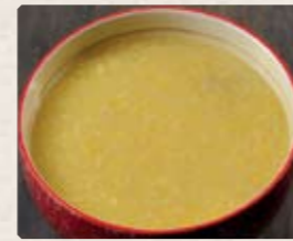
702 - $7.80 / $19.80 雞蓉玉米羹 Sweet Corn & Chicken Soup (Small / Large)