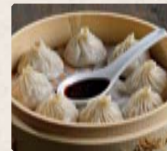
003 - $13.80 灌湯小籠包 Xiao Long Bao Steamed Pork Buns (8 pcs)