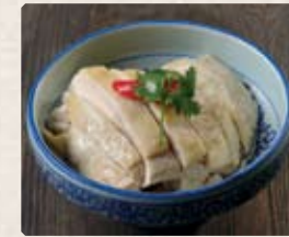
203 - $12.80 紹興醉雞 Drunken Chicken (Served Cold)