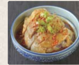
206 - $13.80 天府口水雞 Chicken in Red Chilli Oil (Served Cold)