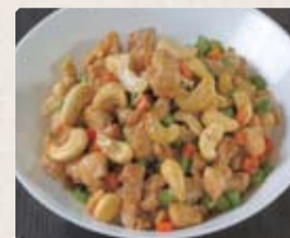
326 - $22.80 腰果雞丁 Stir Fried Chicken with Cashew Nuts