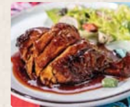
211 - $14.80 里弄醬鴨 Braised Duck In Special Soy Sauce