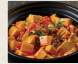
609 - $18.80 麻婆豆腐煲 Ma Po Tofu (Contain Pork Mince)