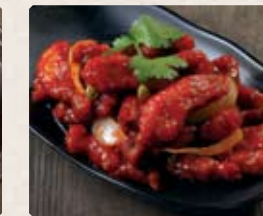
305 - $22.80 秘制京都骨 Peking Pork Chops