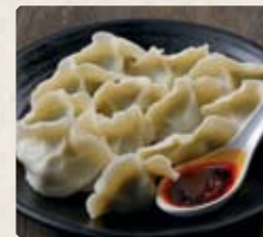
002 - $13.80 韭菜豬肉水餃 Pork and Chive Dumplings (12 pcs)