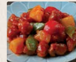
304 - $22.80 菠蘿咕嚕肉 Sweet & Sour Pork