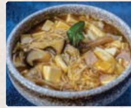
610 - $21.80 三菇豆腐 Three Kind Mushrooms With Tofu In Pumpkin Dressing