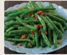
603 - $19.80 干煸四季豆 Stir Fried Green Beans with Pork Mince & Little Shrimp