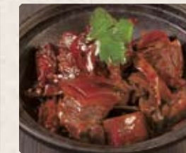
324 - $27.80 上海笋烤肉 Braised Pork Belly with Bamboo Shoot