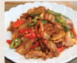
411 - $25.80 農家小炒肉 Spicy Sliced Pork Belly with Mushroom