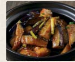
607 - $19.80 燒茄子 Stir Fried Eggplant with Garlic and Coriander