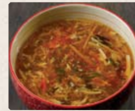
703 - $7.80 / $19.80 弄堂酸辣湯 Hot & Sour Soup (Small / Large) (Contain Shredded Pork)