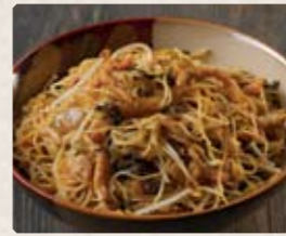
912 - $15.80 雪菜肉絲米粉 Stir Fried Rice Noodles with Preserved Vegetable and Shredded Pork