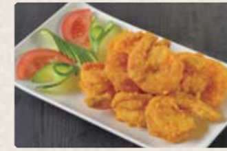
509 - $31.80 高郵鹹蛋黃蝦球 King Prawn with Salty Egg Yolk