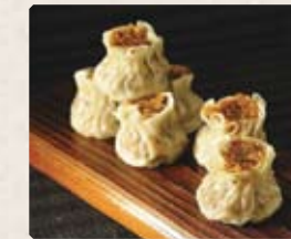
125 - $11.80 老上海糯米燒賣 Sticky Rice Dumplings (6 pcs Contain Bacon)