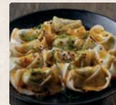
004 - $14.80 紅油抄手 Wonton in Red Chilli Oil Sauce (10 pcs)