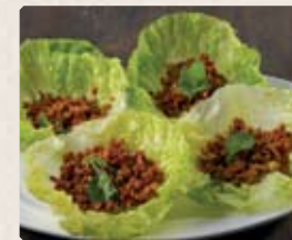
301 - $15.80 干香生菜包 San Choy Bao (Contain Pork Mince)