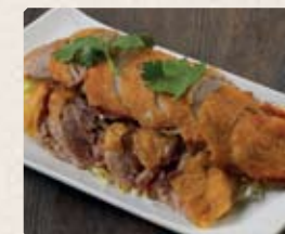
312 - $24.80 香酥鴨(半) Crispy Duck(Half)