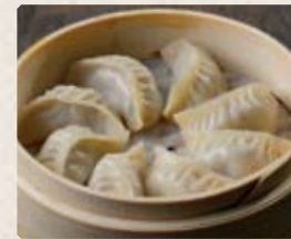
108 - $14.80 里弄羊肉蒸餃 Lamb & Spring Onion Steamed Dumplings (8 pcs)