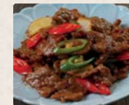
315 - $23.80 潑辣牛肉 Szechuan Style Spicy Beef