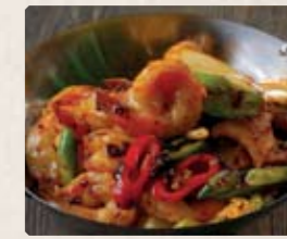
409 - $31.80 干鍋蝦球 Chilli King Prawns in Hot Wok