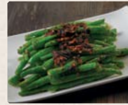
602 - $19.80 攪菜四季豆 Stir Fried Green Beans with Pickled Olive