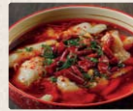
405 - $25.80 水煮魚片 Fish Fillet in Spicy Chilli Oil