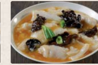
504 - $21.80 淮陽糟溜魚片 Fish Fillet in Chinese Wine Sauce