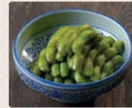
202 - $7.80 鹽水毛豆 Salty Soya Beans (Served Cold)