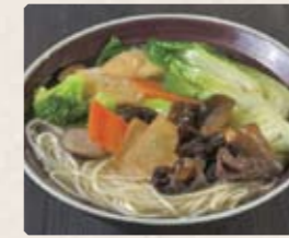
920 - $14.80 老上海素湯麵 Mixed Vegetable Noodle Soup