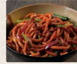
907 - $14.80 上海粗炒 Stir Fried Noodles with Shredded Pork & Vegetables