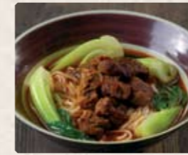
918 - $14.80 川香牛腩麵 Spicy Beef Brisket Noodle Soup