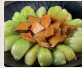
601 - $20.80 雞腿菇扒菜心 Stir Fried Pak Choy with Mushroom