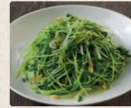
605 - $19.80 酒香銀牙豆苗 Stir Fried Snow Pea Sprout with Bean Sprout