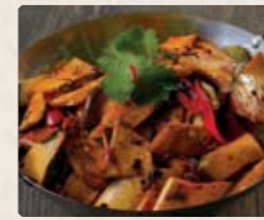
406 - $24.80 干鍋小炒珍菌 Chilli Mushroom in Hot Wok