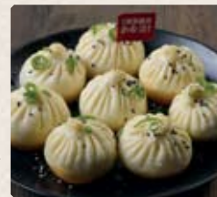
001 - $14.80 天同生煎包 Pan Fried Pork Buns (8 pcs)