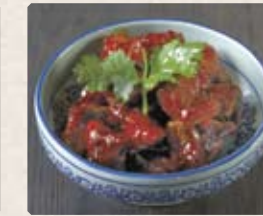
207 - $12.80 糖醋小排 Pork Spare Ribs in Sweet Vinegar