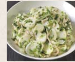
921 - $15.80 薺菜肉絲炒年糕 Stir Fried Rice Cakes with Shredded Pork & Wild Vegetables