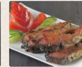
208 - $13.80 里弄熏魚 Shanghai Style Smoked Fish in Soy Sauce