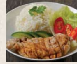
906 - $15.80 香茅豬排飯 Lemon Grass Pork Chop with Rice