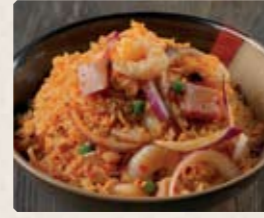
902 - $15.80 香辣特別炒飯 Special Spicy Fried Rice