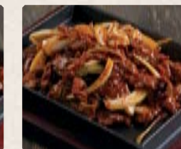
318 - $23.80 鐵板蒙古牛肉 Sizzling Mongolian Beef on Sizzling Hot Plate