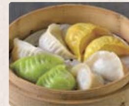
117 - $14.80 花色蒸餃 Steamed Dumpling Combo (8 pcs)