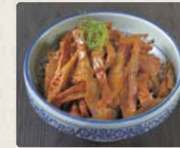
205 - $10.80 上海油燻笋 Braised Bamboo Shoot (Served Cold)