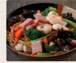
908 - $15.80 什錦細炒 Combination Stir Fried Noodles