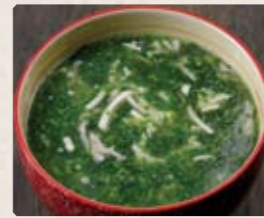
701 - $7.80 / $19.80 薺菜肉絲豆腐羹 Shredded Pork & Green Vegetable with Tofu Soup (Small / Large)