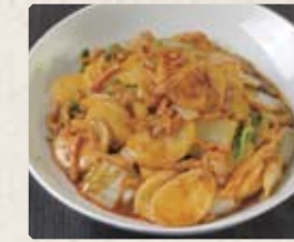
922 - $15.80 白菜肉絲炒年糕 Stir Fried Rice Cakes with Shredded Pork & Chinese Cabbage