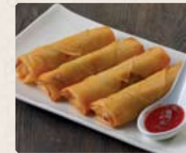
110 - $9.50 素食春卷 Vegetarian Spring Rolls (4 pcs)