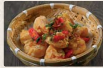
501 - $31.80 椒鹽蝦球 Salt & Pepper King Prawns