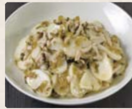
923 - $15.80 雪菜肉絲炒年糕 Stir Fried Rice Cakes with Shredded Pork & Preserved Vegetable