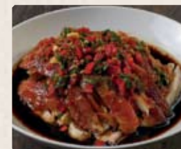
309 - $24.80 山東脆皮雞 Shandong Crispy Skin Chicken