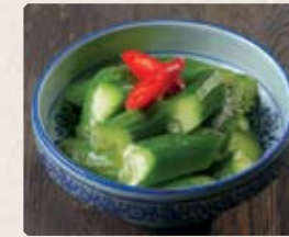
204 - $9.80 蒜拍黃瓜 Cucumber in Garlic & Vinegar (Served Cold)