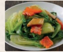
606 - $19.80 西蘭花雜菜 Stir Fried Mixed Vegetables