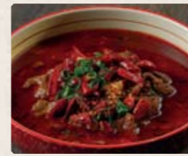
403 - $26.80 水煮牛肉 Beef in Spicy Chilli Oil