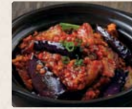
608 - $19.80 魚香茄子煲 Eggplant & Pork Mince in Sweet Chilli Vinegar