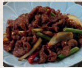
319 - $27.80 孜然羊肉 Cumin Lamb