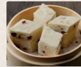
802 - $9.80 棗泥千層糕 Layered Red Date Cake (4pcs)