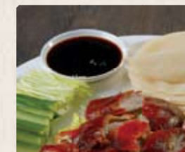
313 - $63.80 京式片皮鴨(整) 16塊鴨餅+16塊鴨塊 二道生菜包(12張)或鴨絲炒麵 Whole Peking Duck with Pancakes 16pcs, 16 Duck Pieces, San Choy Bao 12pcs or Fried Noodles