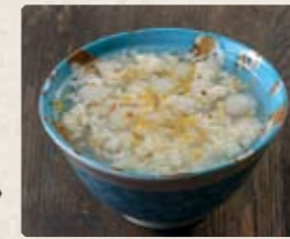
801 - $8.80 / $21.80 酒釀小湯圓 Rice Ball in Fermented Rice Soup