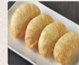
113 - $12.80 蘿蔔絲酥餅 Shanghai Turnip Croissant (4pcs Contain Bacon)