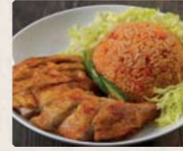
905 - $15.80 炸雞紅飯 Crispy Skin Chicken with Red Fried Rice