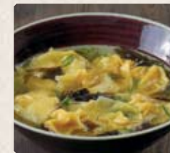
103 - $12.80 蝦肉小餛飩 Pork & Prawn Wonton Soup (12 pcs)