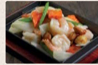
502 - $30.80 鐵板蒜子蝦球 Sizzling Garlic King Prawns on Hot Plate