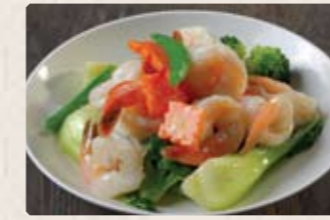
503 - $30.80 時菜蝦球 Stir Fried King Prawn with Seasonal Vegetables