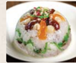
120 - $12.80 特色自製八寶飯 Eight - Treasure Sticky Rice Pudding