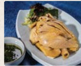
212 - $28.80 農場蔥油走地雞 Cage Free Chicken with Scallion Oil (Served Cold)