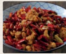
401 - $22.80 干辣雞丁 Spicy Diced Chicken