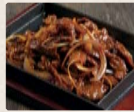
320 - $27.80 鐵板蒙古羊肉 Sizzling Mongolian Lamb on Hot Plate