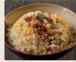
903 - $15.80 XO醬雞粒炒飯 Diced Chicken Fried Rice with (XO Sauce Contain Shrimp)