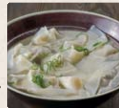
101 - $13.80 薺菜豬肉大餛飩 Pork and Vegetable Wonton Soup (10 pcs)