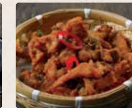
306 - $23.80 椒鹽排骨 Salt & Pepper Pork Ribs