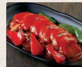
311 - $24.80 甜酸脆皮鴨 Crispy Skin Duck in Sweet & Sour Sauce