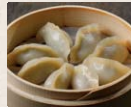
107 - $14.80 里弄牛肉蒸餃 Beef & Baby Celery Steamed Dumplings (8 pcs)