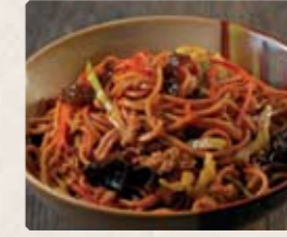
909 - $15.80 木須細炒 Stir Fried Vegetarian Noodles (with Egg)