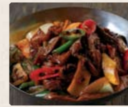
407 - $25.80 干鍋牛肉 Chilli Beef in Hot Wok