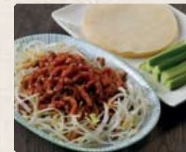
302 - $25.80 京醬肉絲+夾餅 Peking Style Shredded Pork + Pancakes