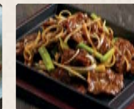
317 - $22.80 鐵板燻爆牛肉 Sizzling Sliced Beef with Spring Onion on Hot Plate