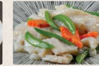
505 - $21.80 蜜豆魚片 Stir Fried Fish Fillet with Honey Beans