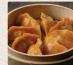
105 - $12.80 雞肉玉米蒸餃 Chicken & Corn Steamed Dumplings (8 pcs)