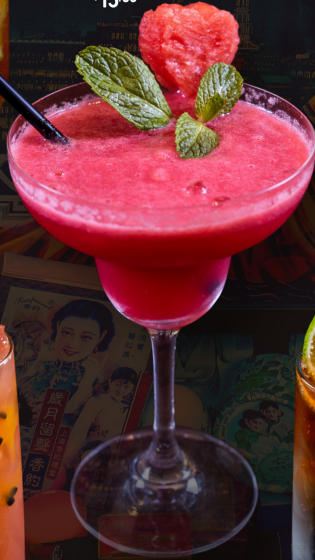
NIGHT IN SHANGHAI $13.80