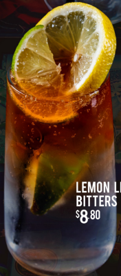
LEMON LIME BITTERS $8.80