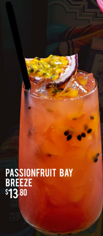
PASSIONFRUIT BAY BREEZE $13.80