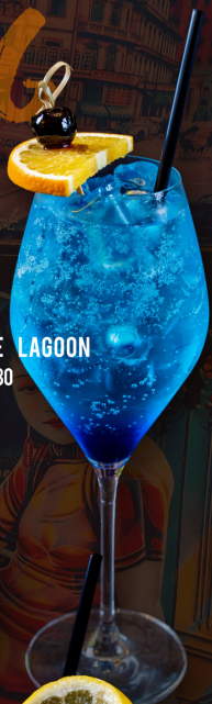
BLUE LAGOON $13.80